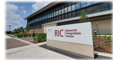
TAMUS & RELIS